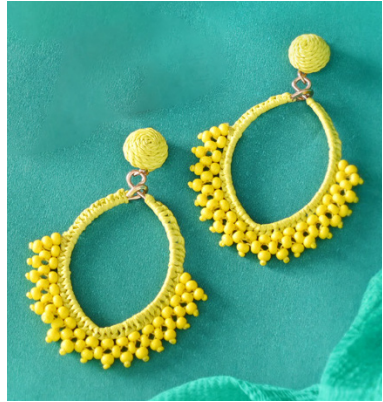
Summer Bliss Earrings (2N) MRP: ₹399