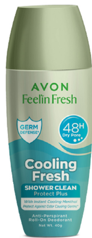
Feelin Fresh Cooling Fresh Antibacterial ROD Women 40g 45826 MRP: ₹289