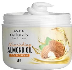
Naturals Nourishing Almond Oil Cold Cream 50g 45838 MRP: ₹169