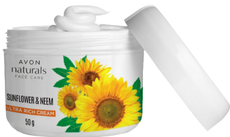
Naturals Sunflower & Neem Ultra Rich Cream 50g 45837 MRP: ₹169