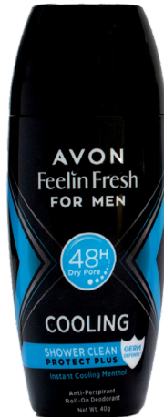
Feelin Fresh Cooling Antibacterial ROD Men 40g 45823 MRP: ₹289