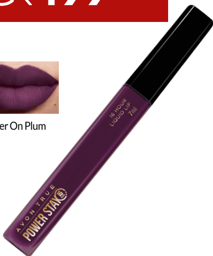
Avon True Powerstay 16 Hour Liquid Lip 7ml 45857 MRP: ₹899