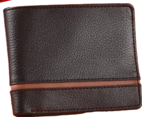
Charcoal Mens Wallet MRP: ₹1199