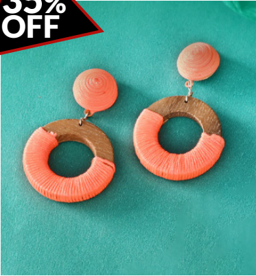
Tangerine Threadwork Earrings (2N) MRP: ₹399