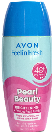
Feelin Fresh Pearl Brightening+ ROD Women 40g 45822 MRP: ₹299