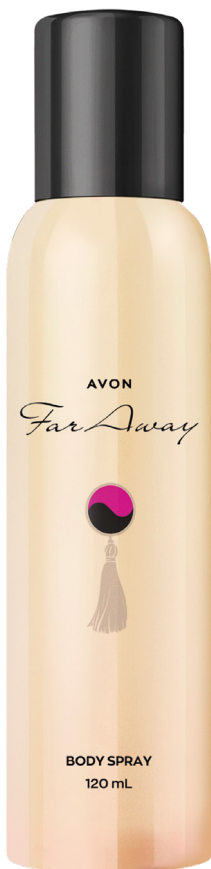
Far Away Classic Body Spray 120ml 45820 MRP: ₹399