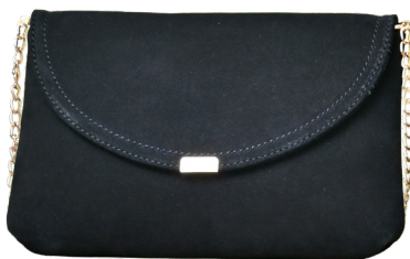
Luxe Black Sling Bag MRP: ₹1599