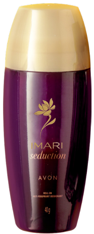
Imari Seduction Deodorant Roll on 40g 45827 MRP: ₹299

In case of out of stock, please select from other available option. Product which are not 2 or its multiples, will be billed at MRP. Mix & match allowed