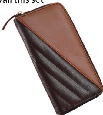
Boddess Classic Wallet MRP: ₹1699

In case of out of stock, individual items will be billed at effective price