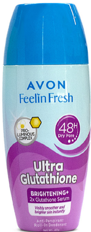
Feelin Fresh Ultra Gluta Brightening ROD Women 40g 45825 MRP: ₹299