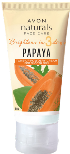
Naturals Papaya Powdery Cream 50g 45835 MRP: ₹299