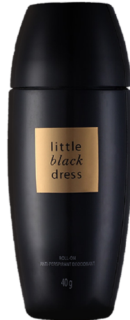
Little Black Dress ROD 40g 45824 MRP: ₹299