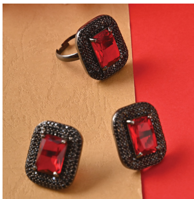
Black Majesty Giftset (3N) MRP: ₹1999

In case of out of stock, individual items will be billed at effective price