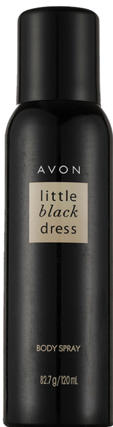
Little Black Dress Classic Body Spray 120ml 45821 MRP: ₹399