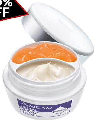
Anew Lifting Dual Eye System 20ml 45858 MRP: ₹1499