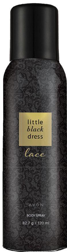
Little Black Dress Lace Body Spray 120ml 45819 MRP: ₹350

In case of out of stock, please select from other available option. Product which are not 2 or its multiples, will be billed at MRP. Mix & match allowed